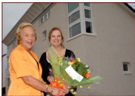
Opening at George Place, Greenan

The association's new build properties were all let without any void period last year.