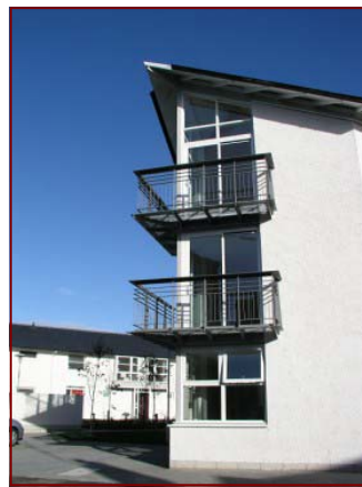
Hamilton Street, Girvan 13 Flats

Again, our work has received national recognition at the Scottish Design Awards and the Saltire Society's Housing Awards.