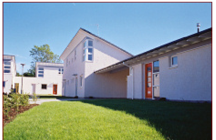
St Bride's Way, Coylton, 14 houses

Contact Details: Ayrshire Housing, 119 Main Street, Ayr, KA8 8BX Tel: 01292 880120 Fax: 01292 880121 Email: info@ayrshirehousing.org.uk www.ayrshirehousing.org.uk