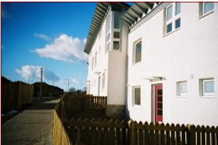
Baird Road, Monkton, 8 houses

A ballot is therefore required only in the community category this year. All community members will shortly receive a postal ballot. The Board has agreed that this will be held using the single transferable voting system.