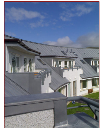
Douneburn, Girvan 13 houses and 9 flats