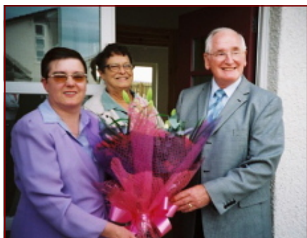
Opening at High Park Road, Coylton